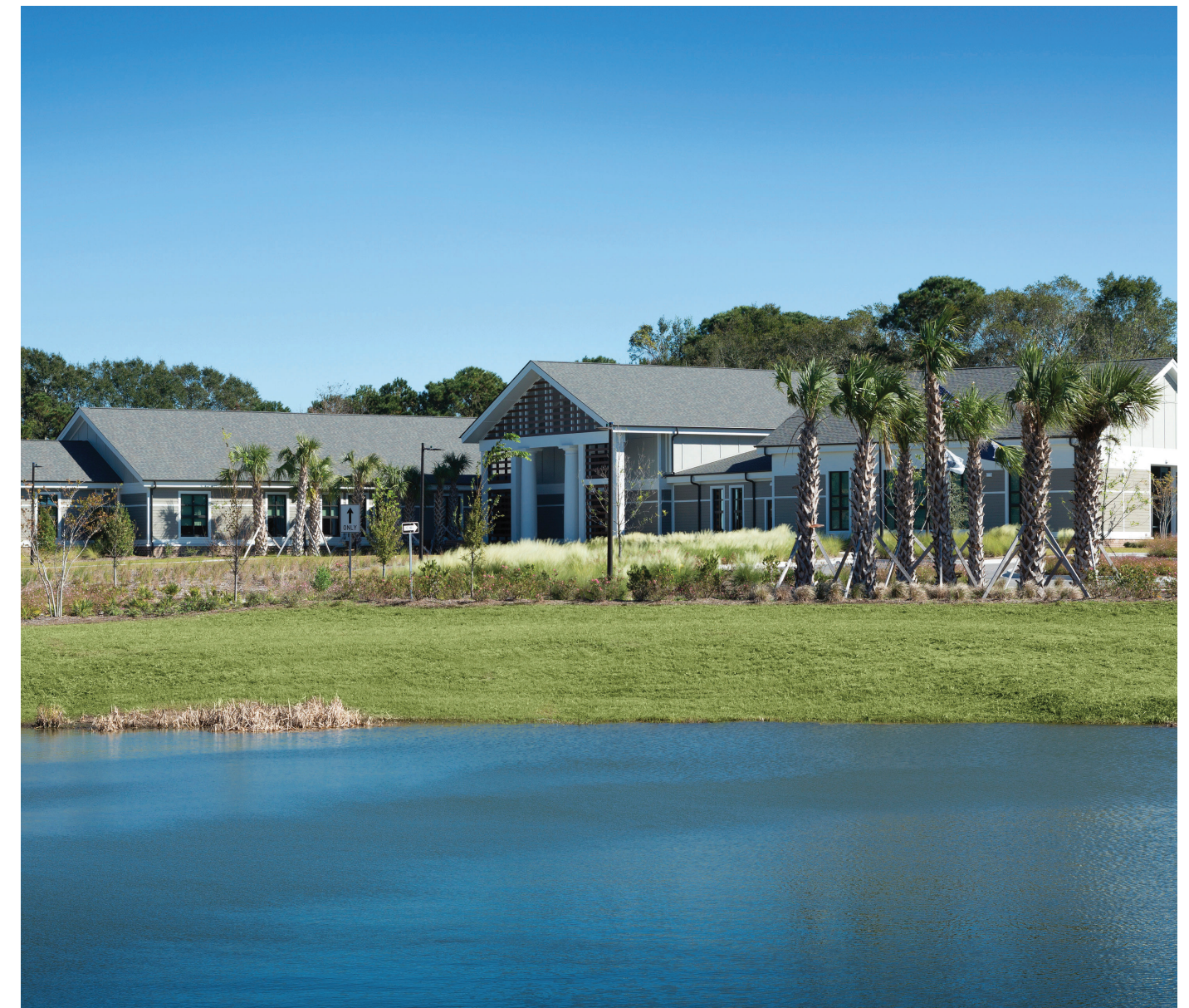
The Town's Municipal Center Complex